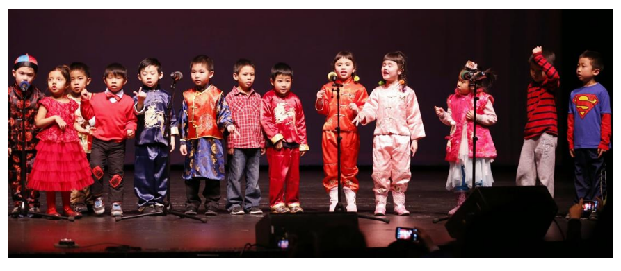
A Scene from Chinese Spring Gala in February, 2015