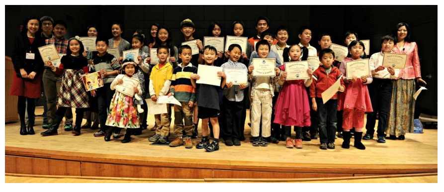
Award Time of the Talent Show in December, 2014